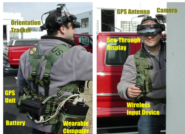
Figure 2: An annotated view of the hardware configuration of the current BARS prototype.

A channel contains a class of objects and distributes information about those objects to members of the channel. Some channels are based on physical areas, and as the user moves through the environment or modifies the spatial filter, the system automatically joins or leaves those channels. Other channels are based on semantic information, such as route information only applicable to one set of users, or phase lines only applicable to another set of users. In this case, the user voluntarily joins the channel containing that information, or a commander can join that user to the channel.