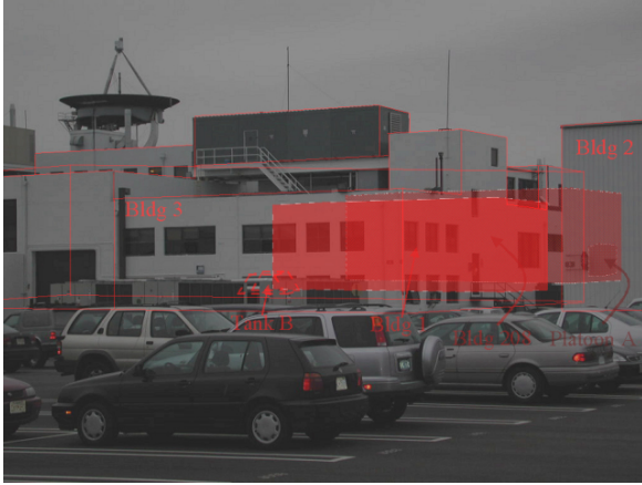
Figure 3: A sample protocol to show the location of occluded objects. The first three layers are shown with outlines of varying styles. The last three layers are shown with filled shapes of varying styles.